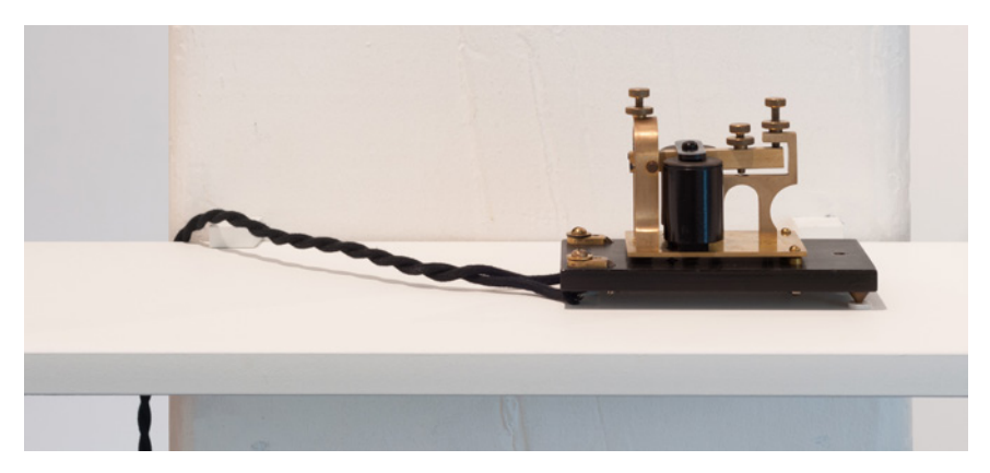
A Question of Style, 2015 two vintage Western Electric brass telegraph sounders, electronics, wire; dimensions variable