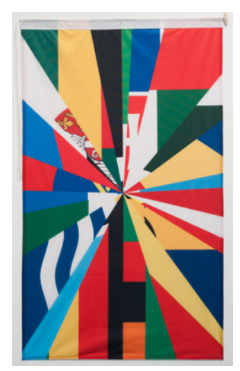
Citizen Ex 001 and 002, 2015 printed synthetic fabric, 62 x 36 inches (each)